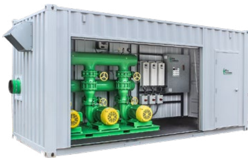
ExoShed Outdoor Mechanical Room