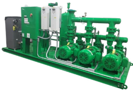
CLEANLOOP HY Series Hydronic Pump Station

Pump stations and filtration also available.