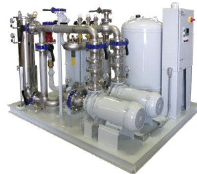
CLEANLOOP NF Series Non-Ferrous Pump Station

OUR HIGHLY EFFICIENT SYSTEMS GUARANTEE LONG LIFE AND MINIMAL DOWNTIME AND MAINTENANCE