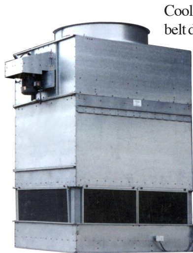
Cooling fan with belt drive motor

Evaporative cooling tower rejects heat to the atmosphere, gravity drains to indoor sump for freeze protection