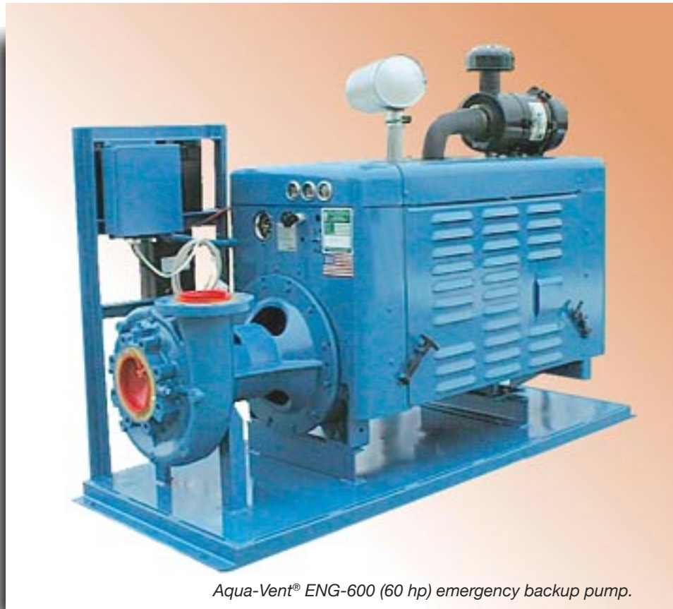
Aqua-Vent® ENG-600 (60 hp) emergency backup pump.