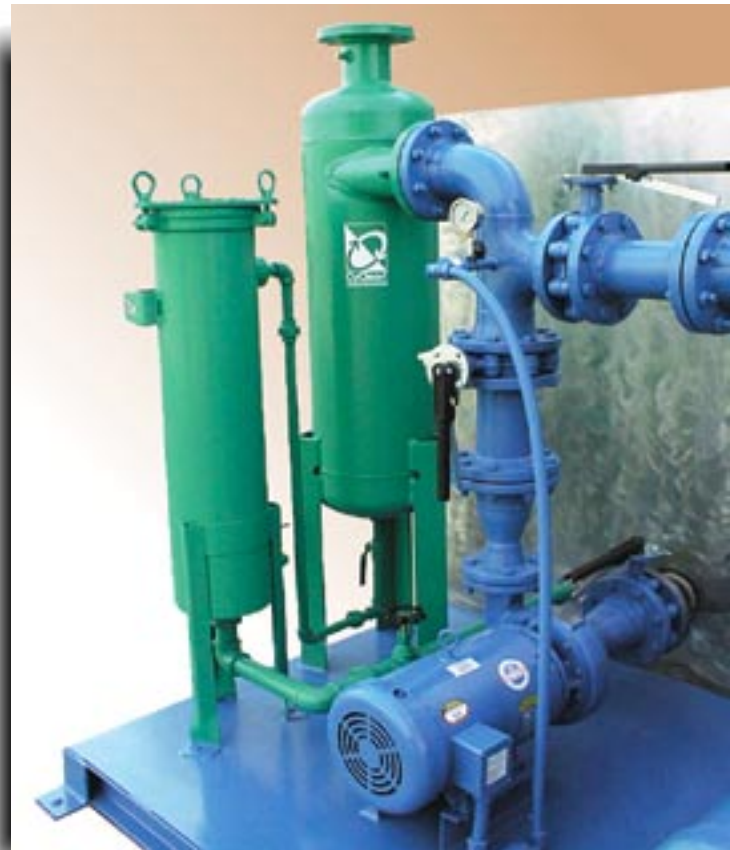
CyClean™ CYB-400 4" centrifugal separator with 2" bag filter for full stream cleaning of 350 GPM of cooling tower process water. Features zero water discharge and easy solids removal without interrupting system operation.