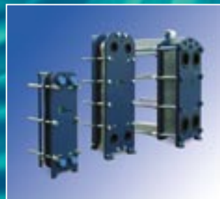
Plate Heat Exchangers