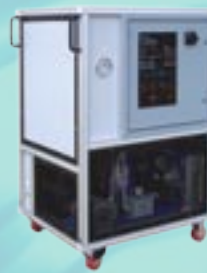
Precision Temperature Control Unit Programmable Heating and Cooling with adjustable Ramp & Soak \pm 0.5^{\circ}\text{C}