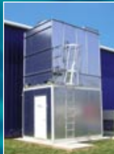
Evaporative Cooling Towers