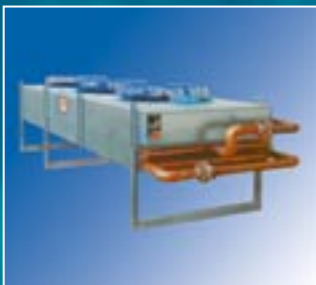
Air Cooled Heat Exchangers