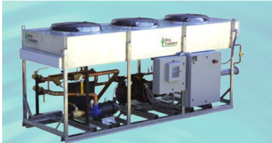
50 Ton Outdoor Air Cooled Chiller with Remote and Local Operator Interface