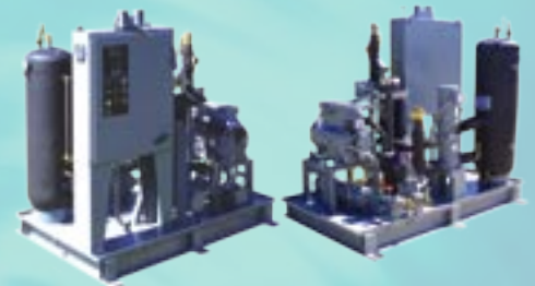
15 Ton Synthetic Oil Cooler for Semi-conductor Manufacturing Process