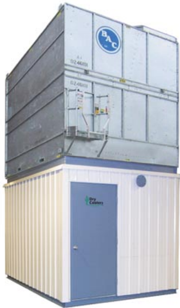
Aqua-Evap TM OMR Series are designed to match the footprint of the cooling tower for a compact and attractive housing for mechanical cooling equipment.

Valuable production floor space should be reserved for production equipment. A cooling tower system is a vital utility that can be safely and efficiently located outside your building. An "Outdoor Mechanical Room" secures your cooling system in an attractive weather-proof enclosure. Engineered packages install easily and can be re-located in the future without difficulty.