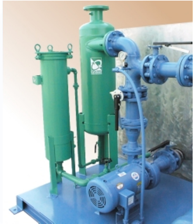
CyClean™ CYB-400 4" centrifugal separator with 2" bag filter for full stream cleaning of 350 GPM of cooling tower process water. Features zero water discharge and easy solids removal without interrupting system operation.